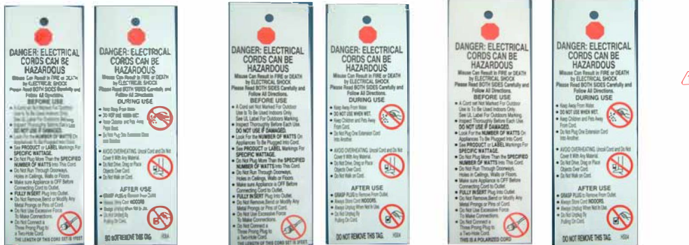
Label for 6FT and above